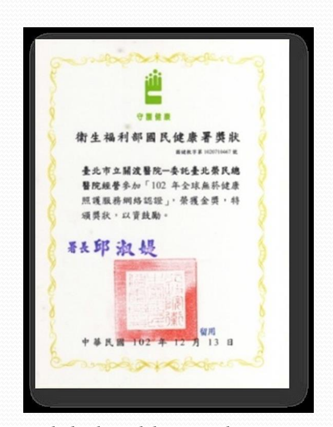
Global Gold Award Smoke-free Health Care Service Certification