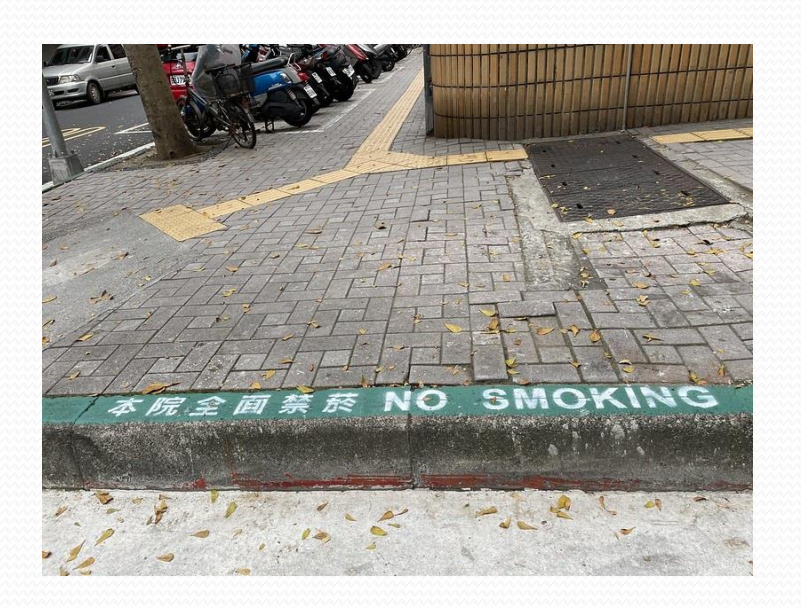
Smoking cessation area on sidewalks around the hospital

After scanning the QRcode, you will be linked to a Google form to write information and notify security that cigarette butts or smokers are found