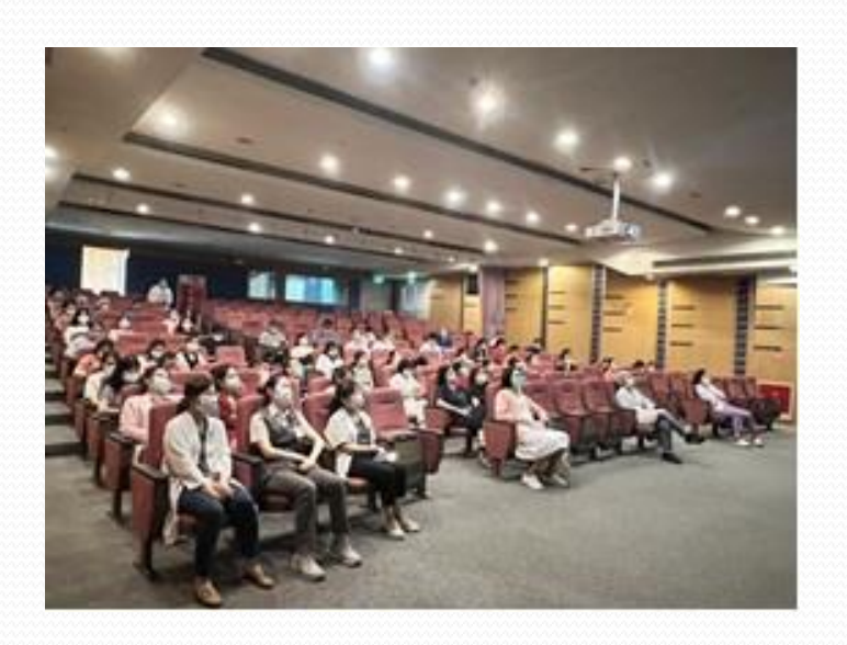
Smoke-free education for employees