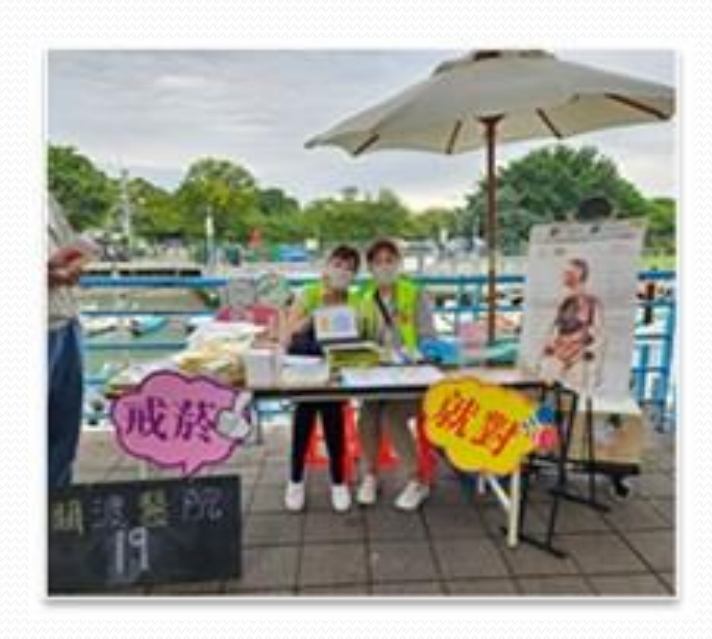
Gandau Festival and Smoking Cessation Promotion