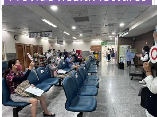
Provide health lectures